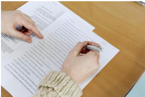
Fig. 2 “The Process,” Wikimedia Commons.

The word “essay” is derived from the French verb “essayer,” which means to attempt or try (OED). In the era of the 140-character tweet, the blog post, the online exhibit, and the rapid-fire social text, the slow, traditional essay may seem stale if not downright moribund. Yet like the étude for the aspiring musician or